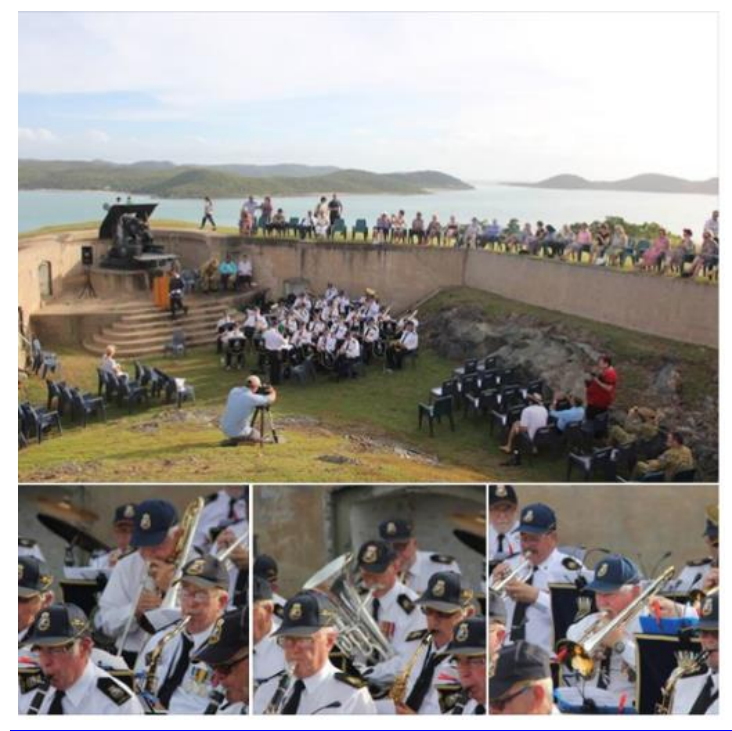
RAN Veterans Band, performing in PNG.

'On a number of occasions now, people that were dying of cancer, that knew it was their last effort to do something, have come along for the last hurrah,' he said. 'In Singapore, we had one chap who knew he was dying. He came over and did all the concerts with us and the Anzac service and came home. Then a few months later, he passed. We've had that happen a number of times.